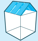
Warm pitched roof - Rafter level